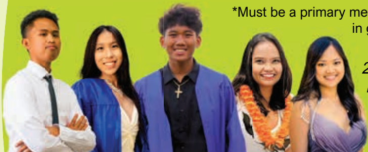
2024 Higher Education Scholarship Recipients

*Must be a primary member MauiFed in good standing.